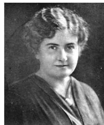
Dr. Maria Montessori (1870 - 1952)

The Montessori system of education, named after Dr. Maria Montessori has today, become synonymous with pre-school education. Her concepts revolutionized the way the world saw small children. She referred to the mind of a child between 3 & 6 years of age, as the Absorbent Mind. During this time he literally absorbs everything in his environment through sensorial exploration. By sensorially absorbing the surroundings, a child forms his personality and himself. He constructs his mind, his memory, power to understand and ability to think through impressions gained from the environment. Educational research has also verified that the early years are the most important years of a child's life. It is during the period between conception and four years that the child develops 50-60 % of his intelligence and another 30% between the ages 4 to 8 years. Very little develops after that. Today each parent wants to give their child the best education, however they have grown to realize that academic achievement alone will not prepare their child for life. Each child has certain vital needs as it grows up. In an academic environment these needs are generalized, hence these needs may be overlooked. However Montessori education strives to fulfill these individual needs. Dr. Maria Montessori believed that a child has the inbuilt tendency to learn by himself. The child is the constructor of the adult. Mother Nature has endowed the child with necessary powers to fulfill this